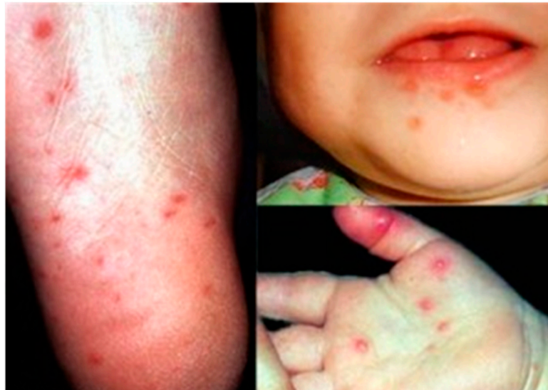
Figure 2. Vesicles on the foot, mouth and palm area of children infected with hand, foot and mouth disease (HFMD). Adapted from the Dermatologic Image Database, Department of Dermatology, University of Iowa College of Medicine, USA, 1996 ( http://tray.dermatology.uiowa.edu/ImageBase ). (Permission granted by University of Iowa) [19].

EV-A71 can produce more severe symptoms such as aseptic meningitis, brain stem encephalitis, acute flaccid paralysis, neurogenic pulmonary edema, delayed neurodevelopment and reduced cognitive function [7]. In 1997, an outbreak of EV-A71 caused 41 deaths in Sarawak, Malaysia. This was followed by a large outbreak in Taiwan involving over 100,000 cases, which led to 78 fatalities [20]. In more recent years, large outbreaks with high fatalities occurred across the Asia Pacific in countries like China, Cambodia and Vietnam [21]. For example, 54 out of the 78 HFMD cases in a 2012 outbreak in Cambodia were highly fatal.