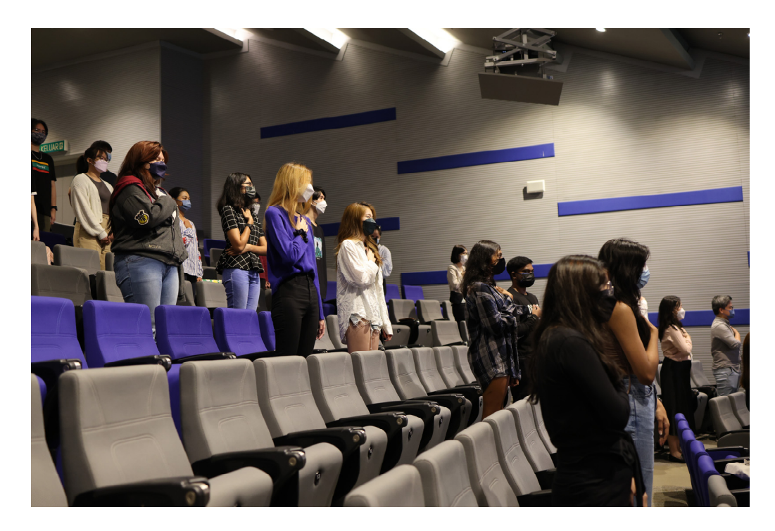
Figure 2. Students reciting the Planetary Health Pledge as part of the undergraduate course on "Community Service for Planetary Health".

first before venturing out to external organisations [17]. This was conducted through implementation of projects that addressed specific planetary health-related issues (such as healthcare waste management, urban farming and raising public awareness) and harnessed their skills in communication and advertising, among others. Each week, students also met with the course instructors for guidance and feedback. On the last day of class, students participated in a graduation ceremony where they recited the "Sunway Planetary Health Pledge" (Figure 2), which was based on the Planetary Health Pledge published in The Lancet in 2020 [27]. This course will continue to be improved through repeated testing and feedback from students, host organisations, and other stakeholders. The university's goal is to make this course available to all 3000 undergraduate students at Sunway University, regardless of their discipline, by 2024, to further strengthen an understanding of planetary health, encourage transdisciplinary collaboration among young people, as well as build the field of planetary health education [28].